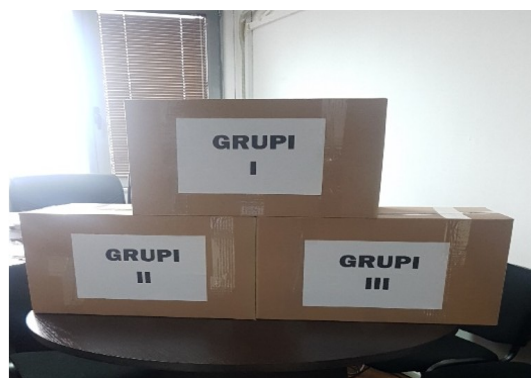
Photocopy of necessary materials and copies

Any paper damaged during photocopying or any poorly copied paper is immediately destroyed.