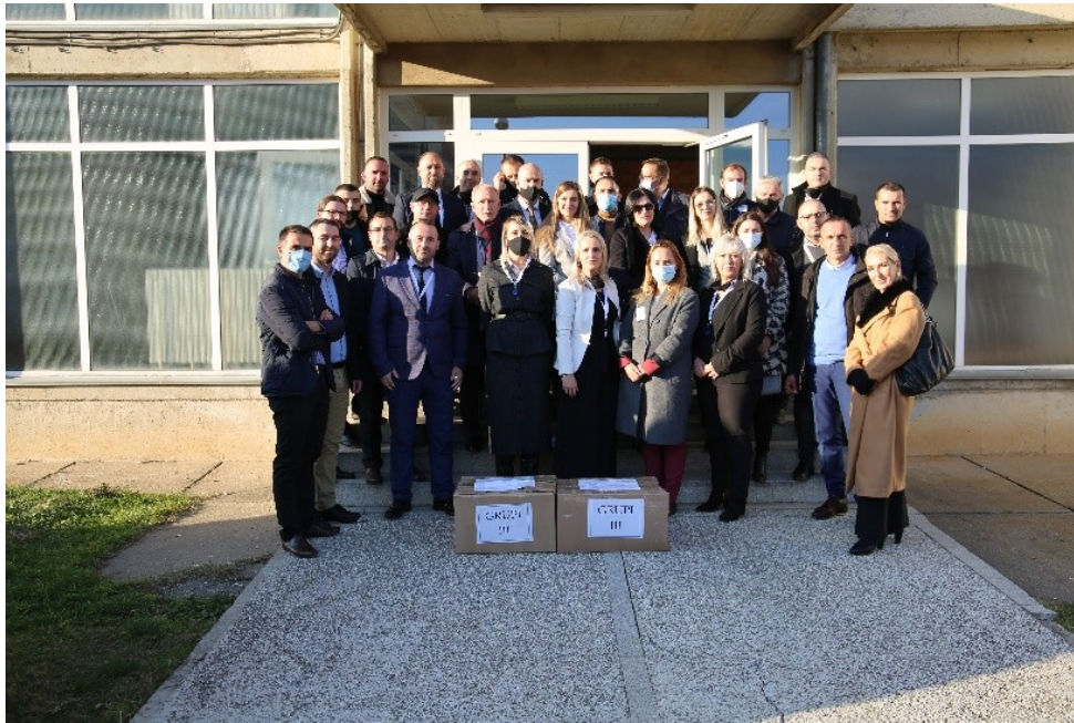
Local, international monitors and support staff upon completion of the Qualification Test

The introductory and concluding instructions were read by the Exam Administrator in Albanian and translated by the translators into Serbian.