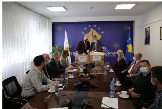
Recruitment Commission and monitors during the opening and evaluation of the Written Test

Present during the opening of the exam package was the Chairman of the KPC as well as representatives of the British Embassy Project who monitored the test evaluation process.