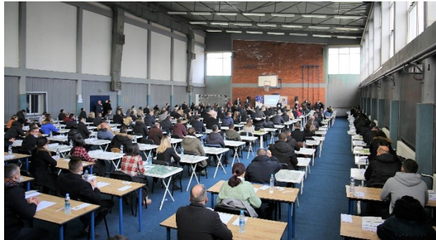
Candidates during the Written Test

One hundred and eighty (180) candidates underwent the test while five (5) had withdrawn in the meantime. All candidates were provided with a summary of substantive and procedural criminal law.