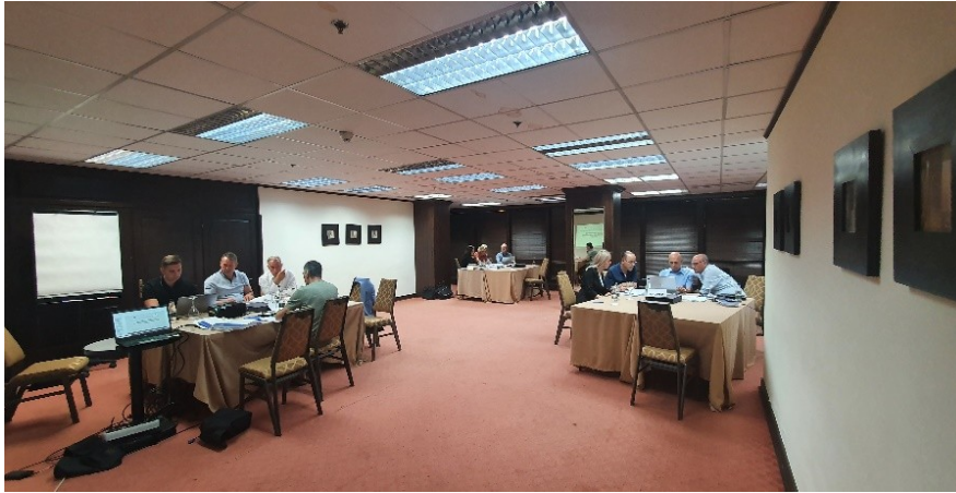
Participants divided into groups

At this roundtable, the members of the Commission worked in three working groups, independently and in complete confidentiality, even physically far from each other. They have drafted the questions based on the applicable laws. Each group has designed questions in the same number for each part of the exam, without knowing the content of the other group's work.