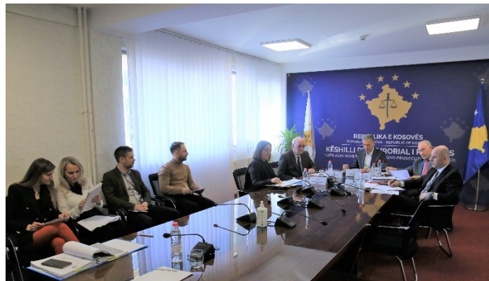
Recruitment Commission during the interviews

The interview, assessment of personal integrity and professional skills according to the Regulation, is evaluated at most 40 points, of which at most 15 points are provided for the assessment of personal integrity.