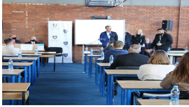
Chief State Prosecutor, Chairman of the KPC and the Commission during the monitoring of the Qualification Test

Each candidate sat at a table for one person respecting the anti covid measures and the tables had enough space for the hall monitors to pass between them both vertically and horizontally.