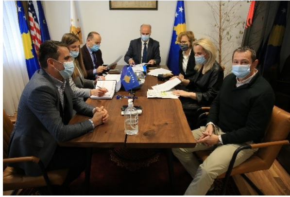
Observers and the Review Committee during the evaluation of complaints against the Written Test

All complainants who had requested access to the written test, this was enabled and this right on 17 January 2019 was used by twelve (12) of them.