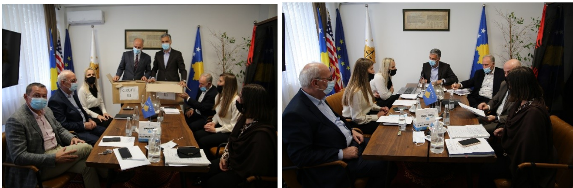
Recruitment Commission and observers during the opening of the exam, verification of questions and evaluation of the Qualifying Test

At first the Commission verified once again the correct questions and answers for which the keys for the correct answers were compiled.