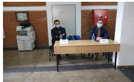
International and local monitors / observers