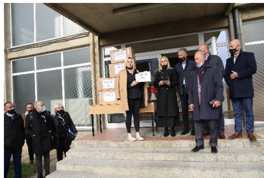
Withdrawal of the lot by the volunteer candidate

Before the exam starts, a volunteer candidate has chosen by lot one of the three versions / groups of the qualifying test exam which would be used in the exam.