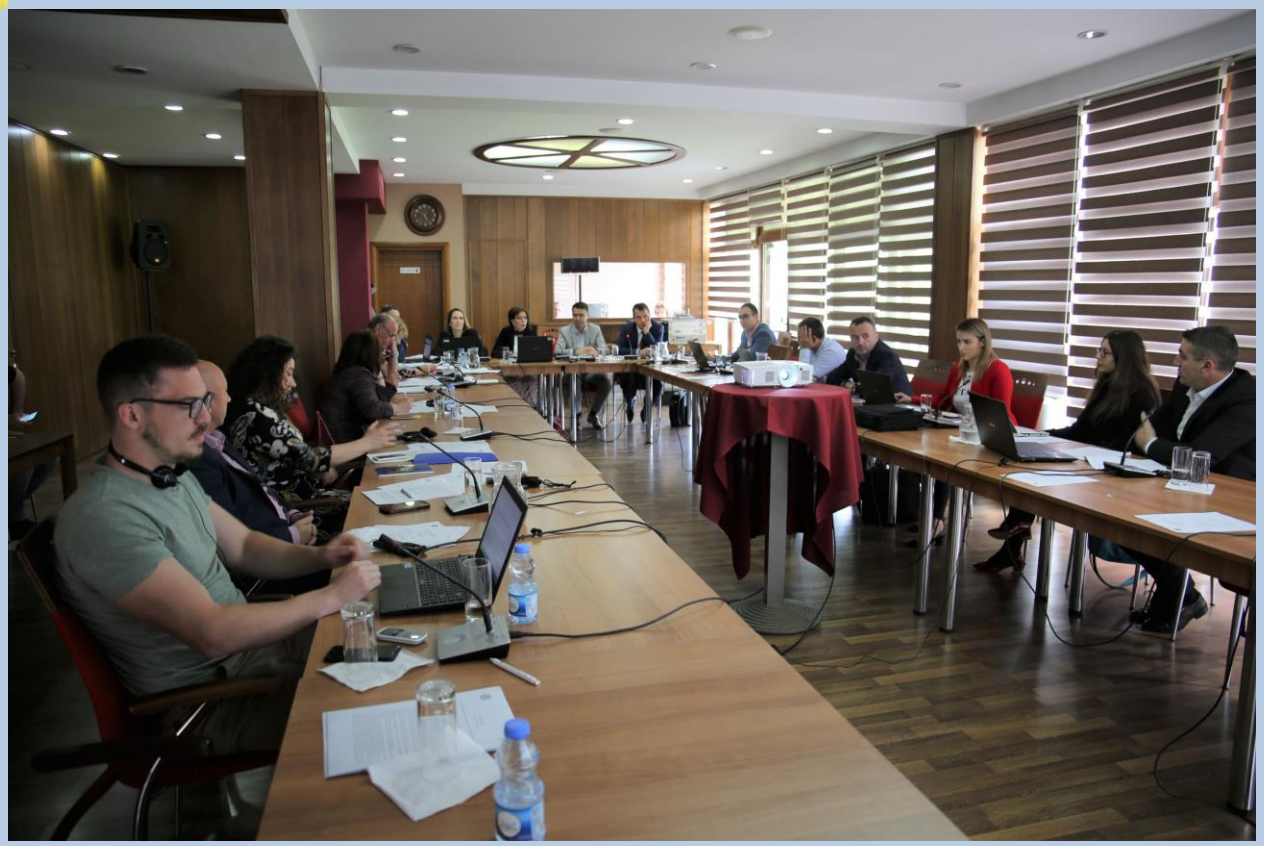
Workshop is being held for drafting the Regulation on the performance evaluation of prosecutors

Pristina, May 30 2019- Kosovo Prosecutorial Council in cooperation with US embassy has organized a three day workshop for drafting the Regulation on the performance evaluation of Prosecutors.