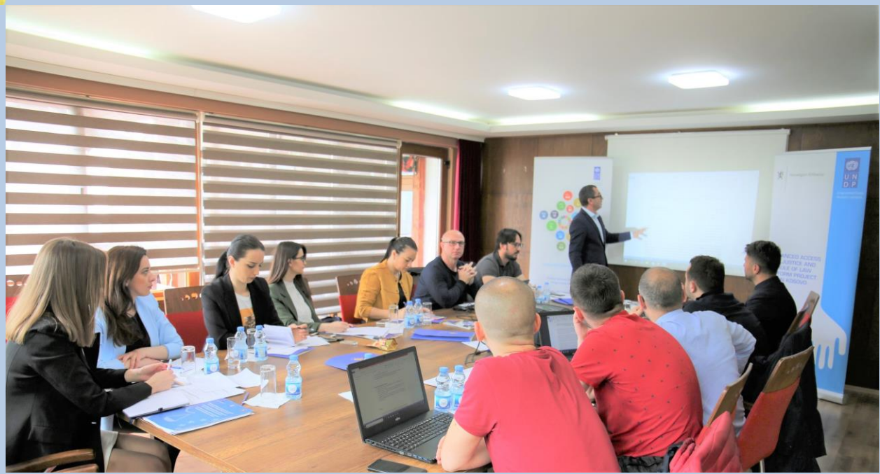
Workshop for the coordination of offices and public communication officers in the prosecutorial system is held

Pristina, May 31, 2019 - Coordination of offices and public communication officers in the prosecutorial system was the focus of the two-day session of the workshop organized by the Kosovo Prosecutorial Council in cooperation with UNDP, attended by public communication officers.