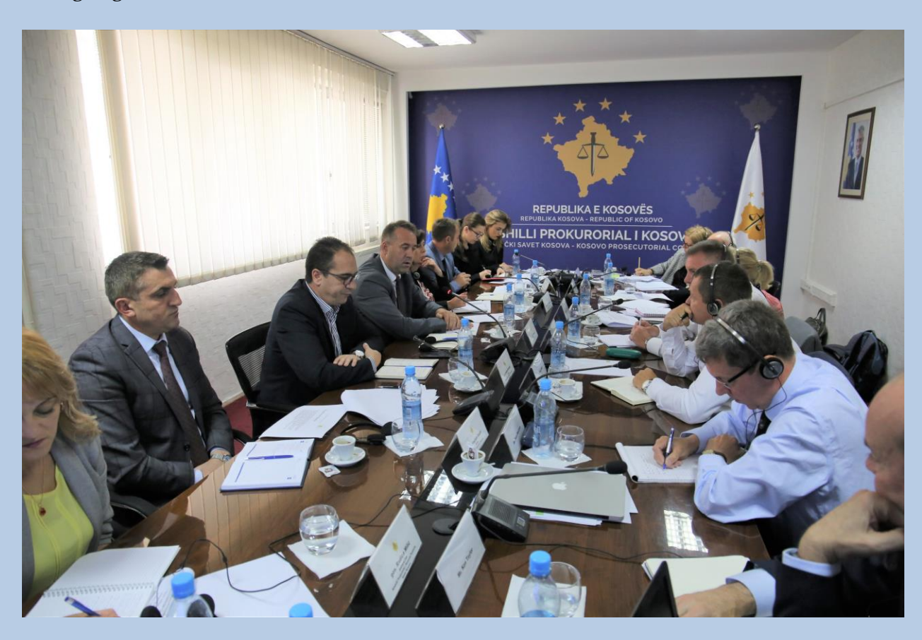
The British project "Strengthening the Justice System in Kosovo" introduces recommendations for advancing the prosecutorial system

Both sides agreed to work together on mutual issues, whereby regular interinstitutional reporting on violence against women and gender-based violence cases will be highlighted.