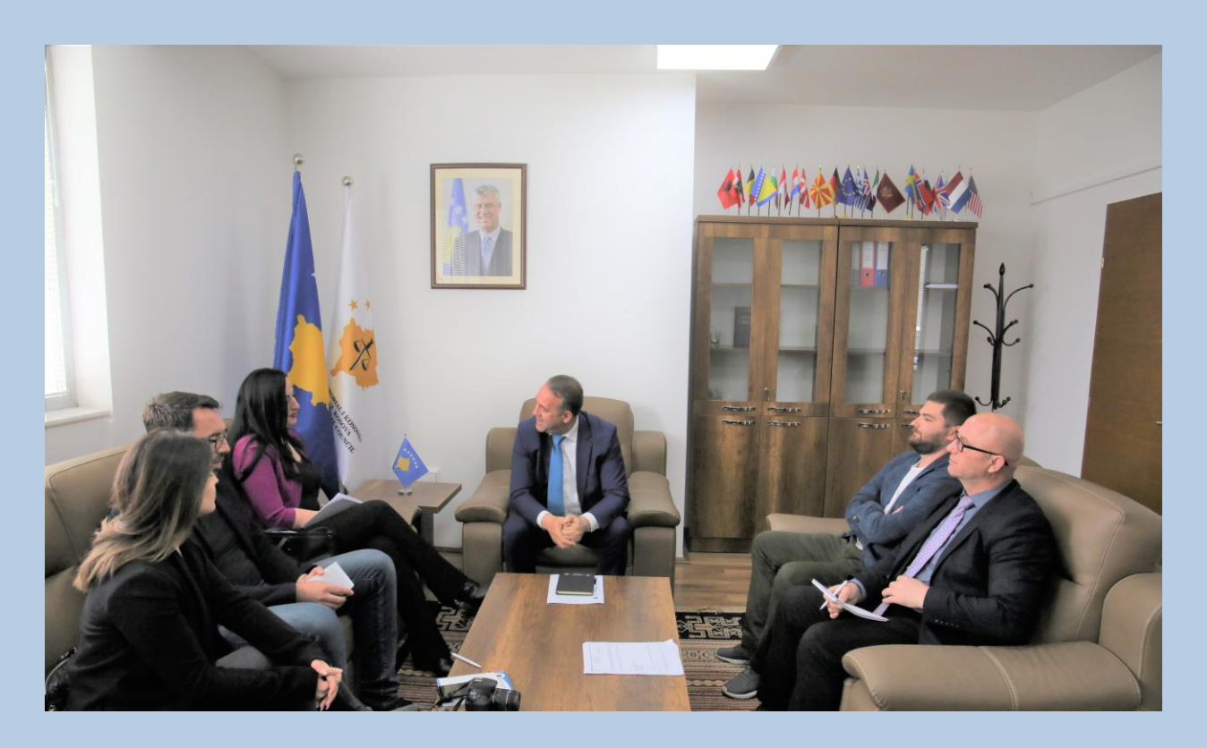
Access and facilitation of the implementation of public communication, topic of discussion between KPC and AJK

While, GSLP will guarantee that any information taken in the prosecutorial system will be handled in accordance with the applicable law, which determines access to public documents and in the sensitive information of the prosecutorial character.