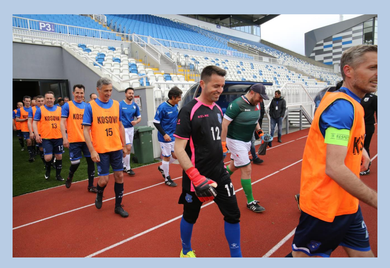
Representatives of the Kosovo prosecutorial and judicial system held a football match with representatives of the Italian judicial system

Pristina, May 6, 2019 - Representatives of the Prosecutorial Council and Judicial Council of Kosovo have developed a football match with representatives of the Italian judicial system, a match which took place at the "Fadil Vokrri" City Stadium in Pristina.