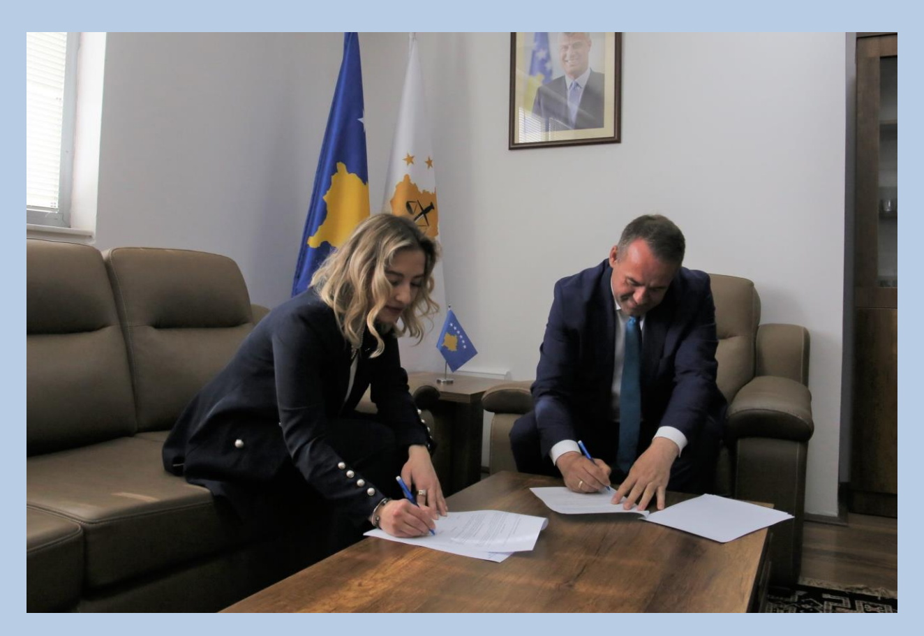
KPS and GLPS signed a memorandum of cooperation

Within the framework of this roundtable it was also emphasized that major improvements have been made in terms of legal infrastructure, but it is necessary to increase the level of its implementation within the mechanisms expected to be advanced as part of the strategic policies of the Kosovo Prosecutorial Council and Judicial Council.