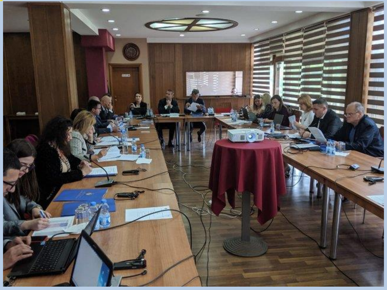
Workshop for drafting the Regulation on appointment of Chief Prosecutors is held

Pristina, May 24, 2019 - The Kosovo Prosecutorial Council (KPC) has held a workshop in the framework of drafting the Regulation on the appointment of the Chief State Prosecutor and Chief Prosecutors of all Prosecutions of the country, based on the current legal framework.