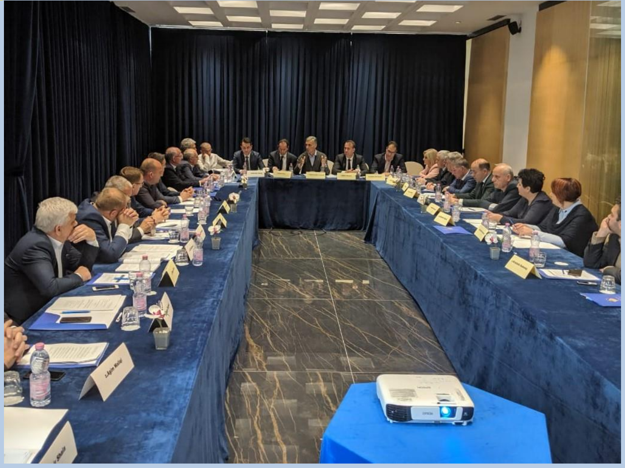
Challenges of seizure and confiscation of illegal property are discussed

Pristina, May 15, 2019 - The Prosecutorial Council and the Kosovo Judicial Council are holding a round table on "Legal Framework on Procedures and the System of Seizure and Confiscation of Illegally Acquired Assets".