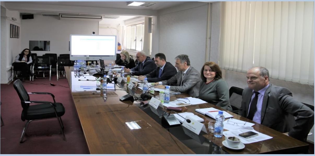
The process of interviewing candidates for state prosecutors is concluded

Pristina, March 9, 2019 - The Kosovo Prosecutorial Council has completed the interviewing phase of fifty candidates in the process of recruiting ten prosecutors at the level of basic prosecutions, interviewing that began on 25 February 2019 and ended on March 8 2019.