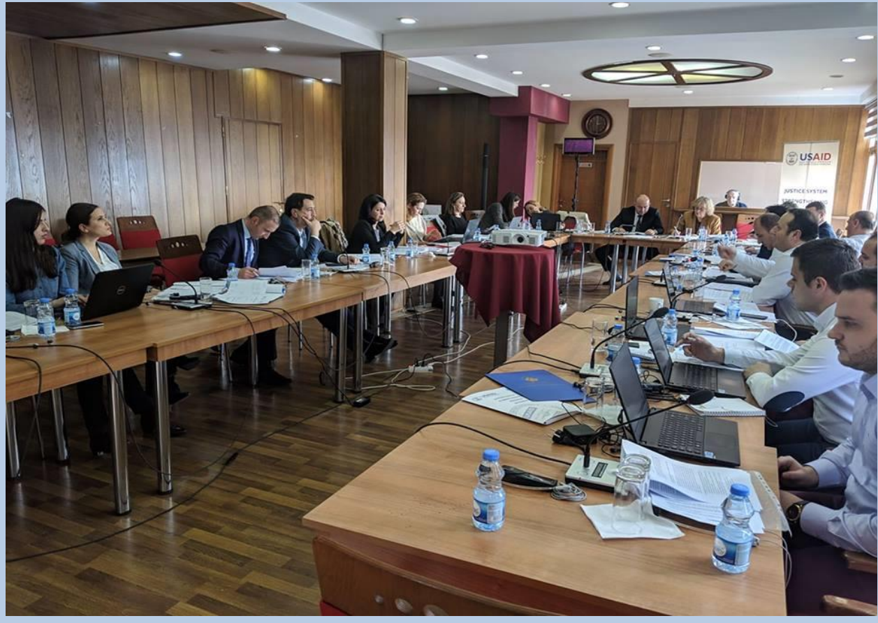
The drafting of the Regulation on Disciplinary Procedure for Prosecutors and Judges continues

Pristina, March 1, 2019 - Prosecutors and judges have been gathered in a two-day workshop on drafting policies for drafting the Regulation on the Implementation of the Law on Disciplinary Procedure for Prosecutors and Judges.