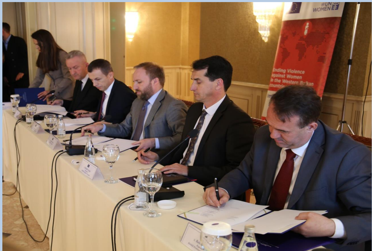
A Memorandum of Multilateral Co-operation on the Database for the recording of Domestic Violence Cases is signed.