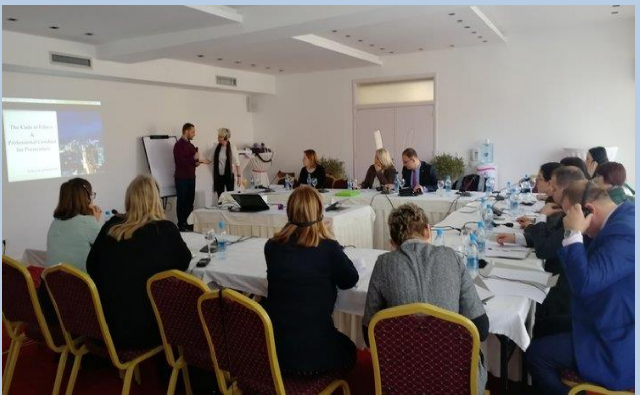
The integrity and professionalism of prosecutors, in the focus of trainings at the beginning of the year

Pristina, March 7, 2019 - In the framework of the initiatives for the implementation of the Code of Ethics and drafting of its Commentary, Kosovo Prosecutorial Council in cooperation with KDI, Levizjen FOL, and the Dutch organization CILC, as well as through the support of the Dutch Embassy in Kosovo at the beginning of this year has organized several training activities for the compilation and implementation of the Code of Ethics and Commentary, which are very important for the ethics and professional conduct of prosecutors.